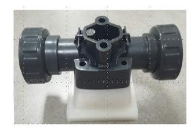
Fluid Valves for Swimming Pools